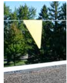
Flags on coated steel cable