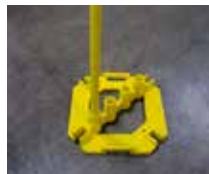
Base and Stanchion