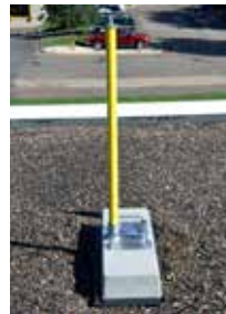
Set and Prevent base