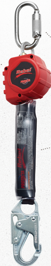
Model Shown - 3100403

Clear PVC coating over EVA foam label on shock pack for improved durability.