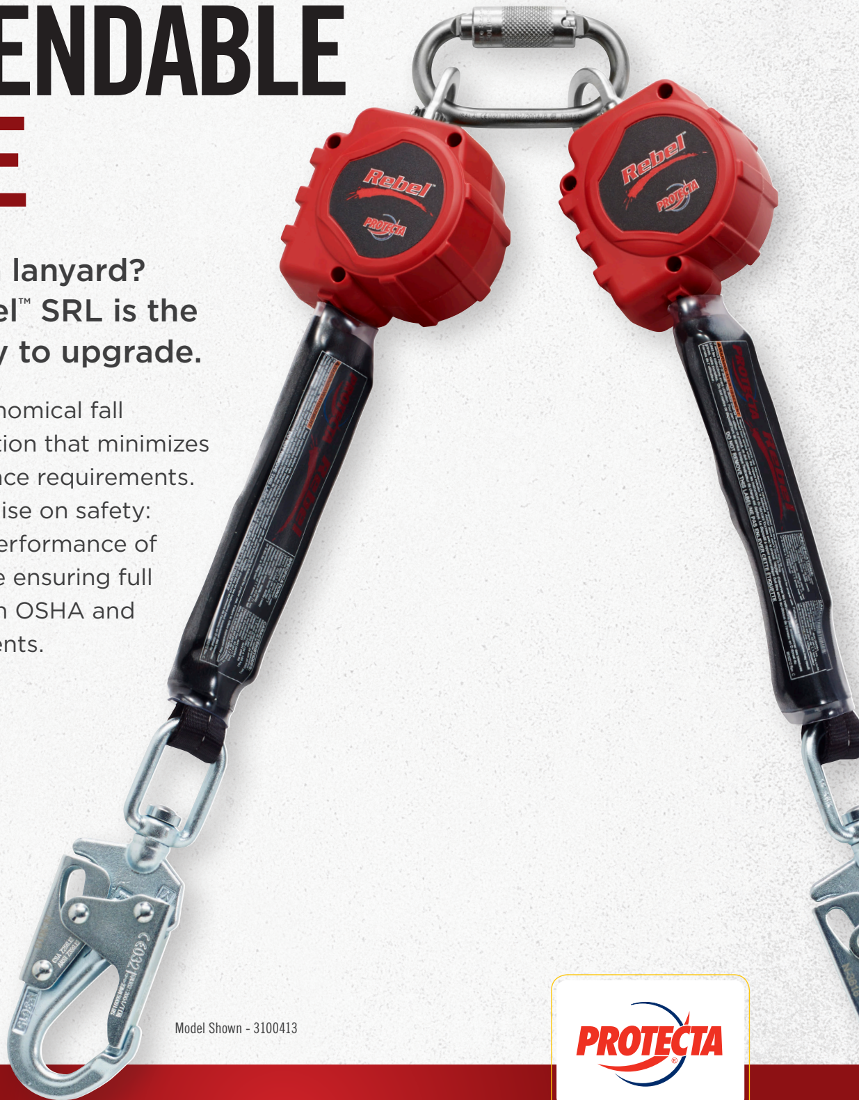
Model Shown - 3100413

You get an economical fall protection solution that minimizes your fall clearance requirements. Don't compromise on safety: maximize the performance of your crew, while ensuring full compliance with OSHA and ANSI requirements.