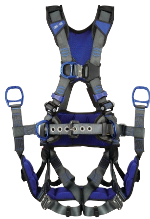
X-Style Tower Climbing (Telecommunications)*