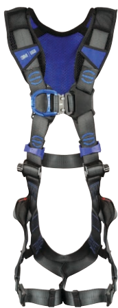
X-Style General Industry Climbing*