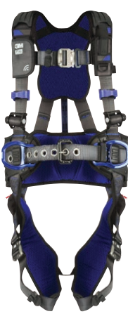
Construction Weight Distribution

Equipped with robust construction hip pad and lightweight back bar to redistribute weight and fatigue from shoulder area.