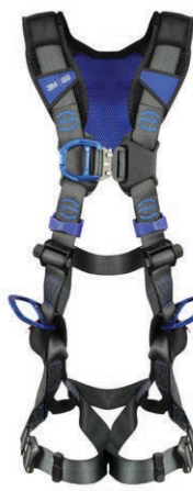
X-Style Climbing/ Positioning (Wind Energy)*