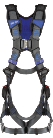
X-Style General Industry

Backed by science to fit your body. Our new quick-connect chest buckle, simplified harness sizing ranges, and leg straps have been designed with you in mind. No matter the season, wardrobe or body shape, the 3M™ DBI-SALA® ExoFit™ X300 Comfort X-Style Safety Harness will help ensure you select a harness that fits your body securely.