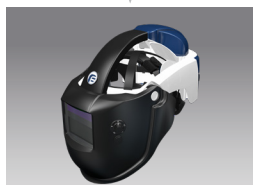
Skeletal Frame Unit w/ Welding Visor/FR Face Seal