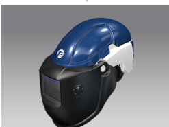
Hard Hat Unit w/ Welding Visor/FR Face Seal