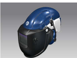
Hard Hat Unit w/ Welding Visor/FR Face Seal Ear Protection