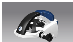
Skeletal Frame Common to All Units