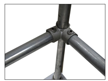
Two sizes with the ability to modify on site ensures a perfect fit.