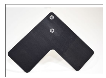
Factory installed rubber pads protects all types of roofs without damage.