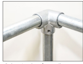
Galvanized, safety yellow or customer colored rails to match building aesthetics.