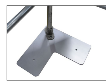
14" thick heavy duty steel base with galvanized finish ensures OSHA compliancy and long lasting durability.