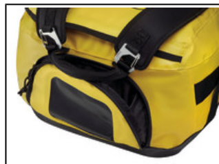
Large side pocket with zipper closure to separate the helmet, shoes or other objects from the rest of the equipment.