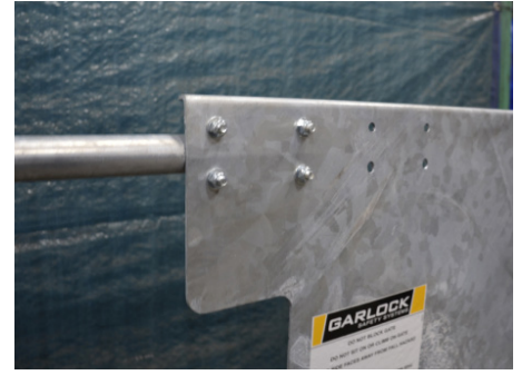
Adjustable Gate Width