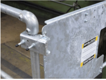
Universal Clamp Mount