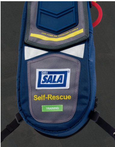
3M™ DBI-SALA® Self-Rescue Training Device

This 50-foot trainer device simulates a realistic fall rescue experience, allowing you to educate your team on the use of the product. It's easy to rewind the rope on-site, so you can train your team up to 20 times before recertification of the device will be required.