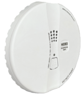
CM-E1 (Round housing flush mount)