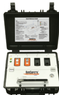
Bump/Cal Test Station