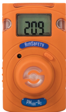
PM 100 -O 2