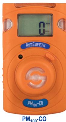
PM 100 -CO