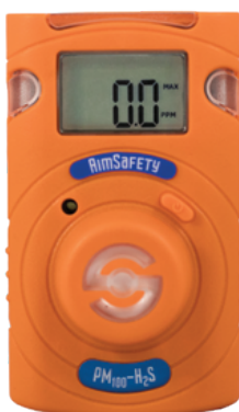
PM 100 -H 2 S